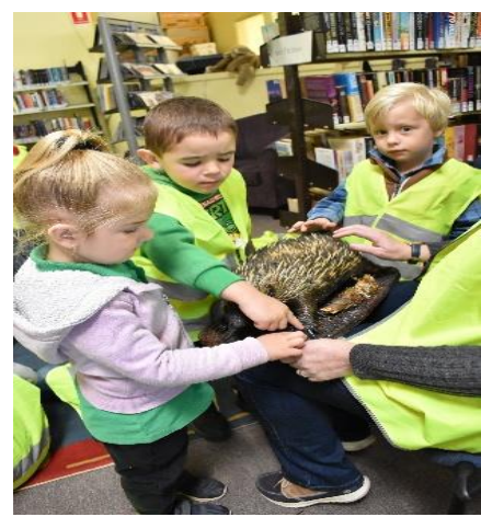
Naidoc week at Baradine learning about Echidna's